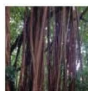
Ficus with aerial roots