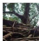
Ficus roots strangling rock