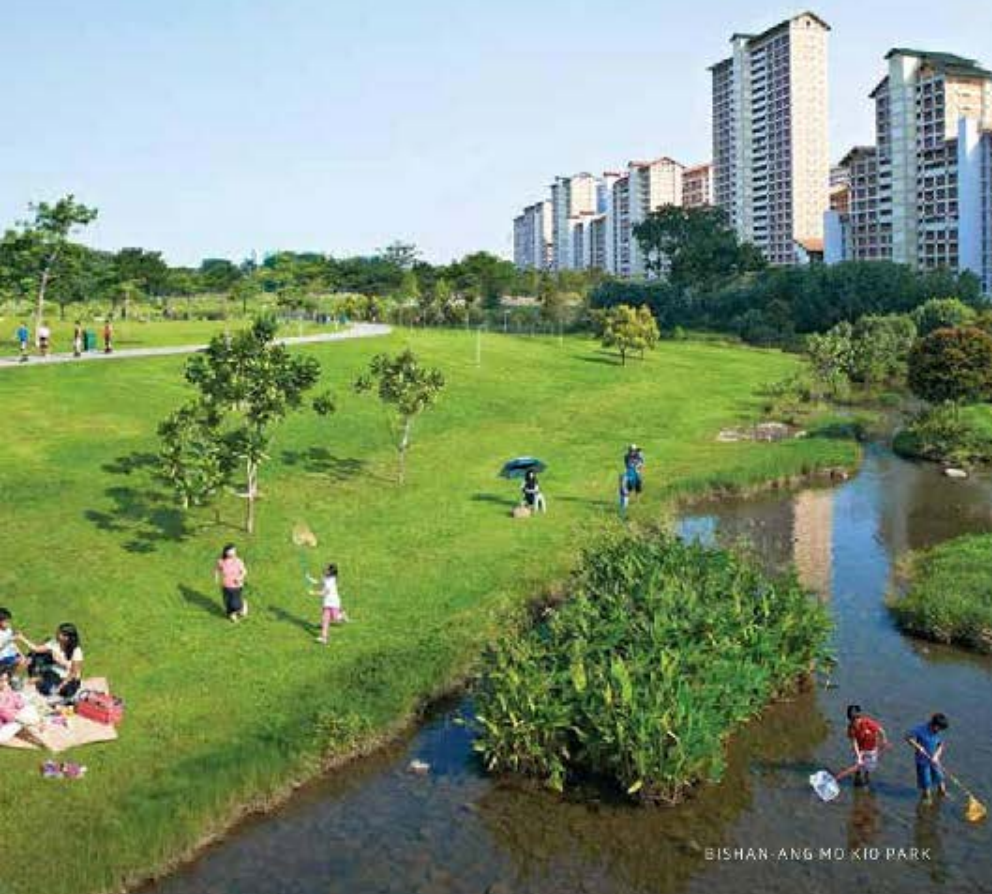
BISHAN-ANG MO KIO PARK