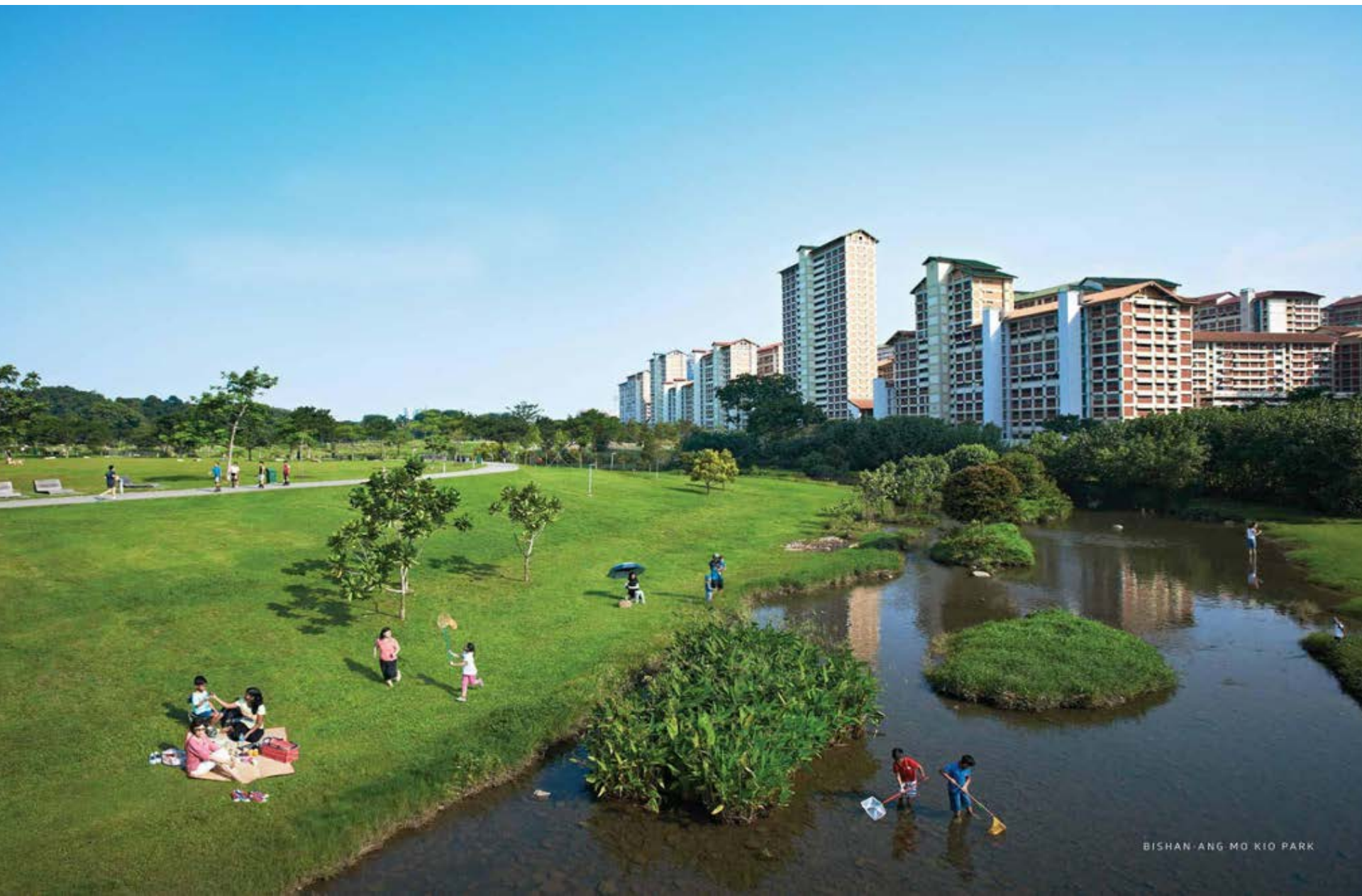
BISHAN-ANG MO KIO PARK